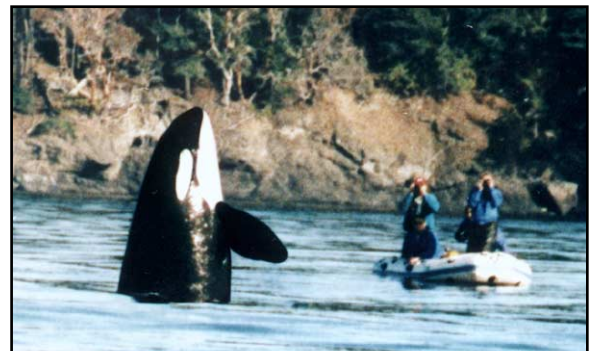
An orca spyhops at Orca Project volunteers

As the peaceful ruler of its world, is the orca a master teacher for humanity?